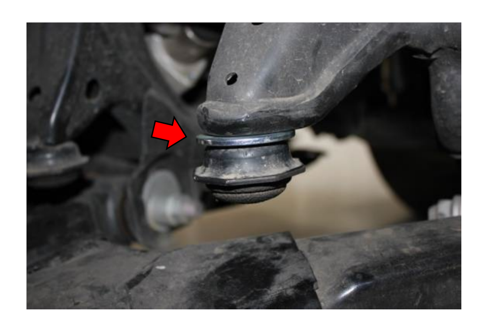
Install 1 bump stop spacer per side as shown